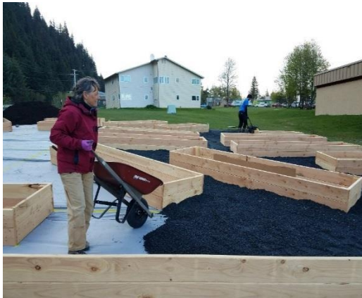
Community garden volunteer hauls gravel; together volunteers hauled nearly 30 yards of gravel in one evening.

A newly formed community group, the Seward Community Garden by the Bay, envisioned building a welcoming gathering space where locals can grow their own produce, share their bounty with the local food bank, and provide educational events throughout the year. Since breaking ground on the community garden on May 19th, the pace of progress has been unbelievable. Altogether, over 50 community volunteers donated nearly 200 hours of their time towards construction of the garden. All 30 beds are built and planted and members are eagerly watching their gardens green out. Park benches have been placed throughout the garden where garden members, the community, and visitors to Seward can relax and enjoy this beautiful garden.