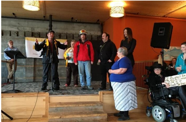
Participants in the Independent Living Center TRAILS program "show and tell" their Alaskan adventures made possible through grant funding.