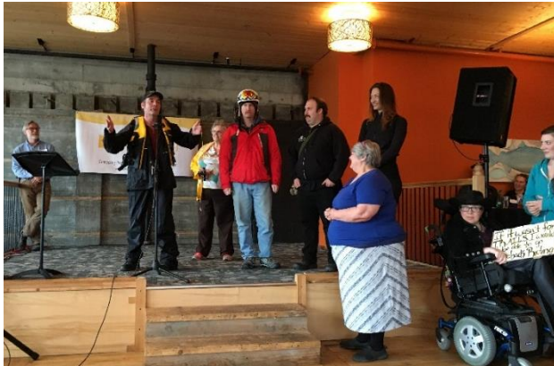
Participants in the Independent Living Center TRAILS program “show and tell” their Alaskan adventures made possible through grant funding.