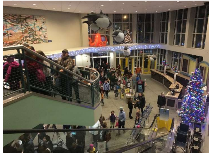
Community members attend the 2016 Community Holiday Party at the Alaska SeaLife Center. SCF is proud to support this annual event with our mini-grants.

Additionally, grants have allowed organizations like our schools, first responders, and the Senior Center, to provide special services and educational programs for all ages.