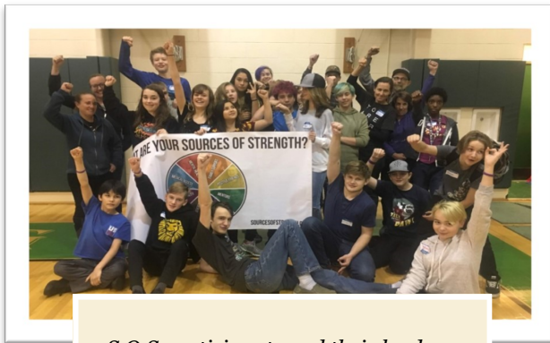
S.O.S participants and their leaders.

on during times of difficulty. Adult advisers help guide the students and build cross generational relationships, giving them trusted advisers to turn to when needed. This evidenced-based international program has been shown to reduce suicide rates, bullying, drug and alcohol use, and other risky behaviors among teens.