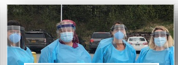
Providence Seward drive-thru clinic