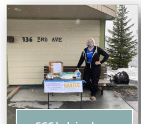
SCC helping keep seniors safe.