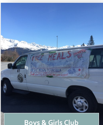
Boys & Girls Club providing critical services to Seward's youth.

Can we get three cheers for our volunteers, frontline workers, and essential workers? Hip, hip, hooray!