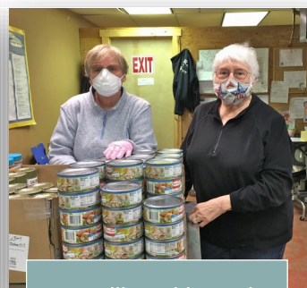
He Will Provide Food Pantry volunteers.