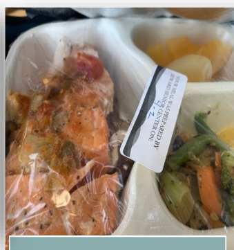
Freshly prepared meal to be delivered by SCC volunteers.